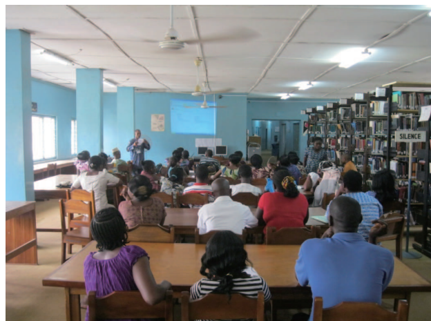
Figure 3 A Cross-Section of Babcock University Library Staff Undergoing Training

In line with the B.U. Library’s policy towards educating users, workshops, seminars, classes, among others have usually been held to educate both staff and students of the University. The approach was seen as impressive as most of the participants commended the librarians for organizing such timely programmes that have put them ahead of their peers in other institutions of higher learning.